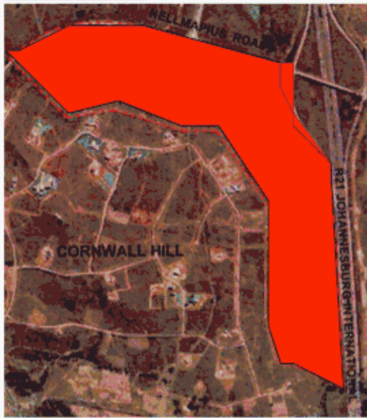
Project Location - North and East of Cornwall Hill